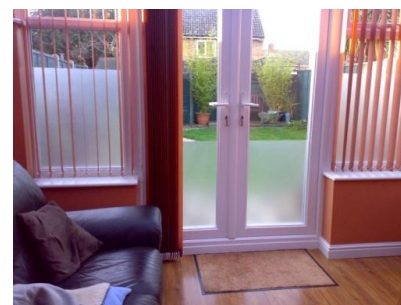
Stress management by blocking view outside

There is no substitute for a comprehensive behavioural assessment in the home but good generic "first aid" advice has a positive impact.