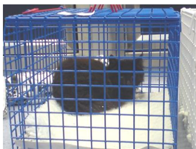
Adopting a cat from rescue