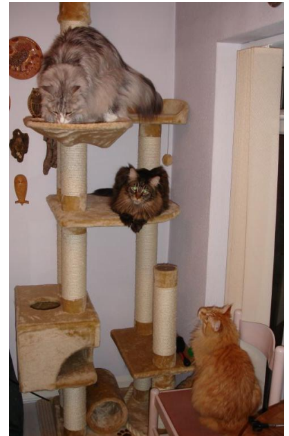
Ensure sufficient resources in multi-cat households when attempting to manage and reduce stress